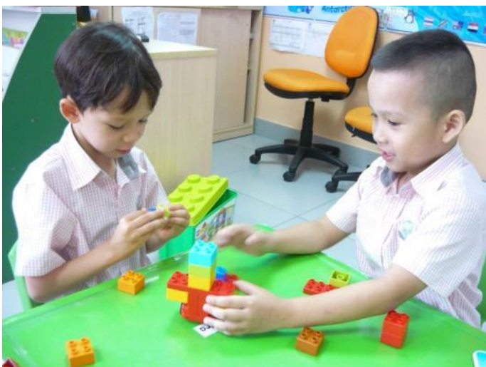
Students learning to be technologically literate and creative