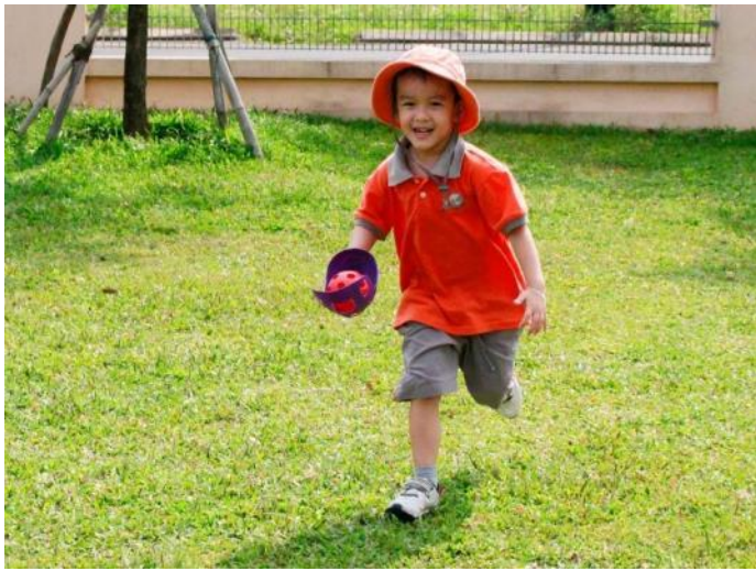
Kindergarten Sports Day