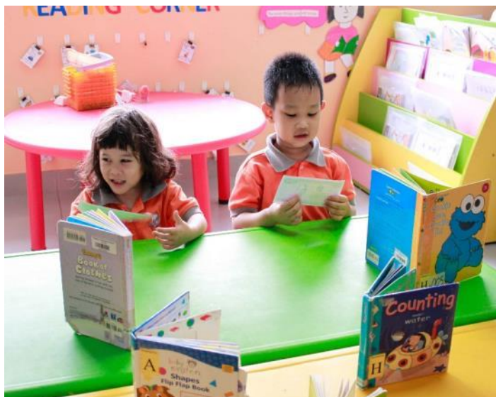
Class literacy activity