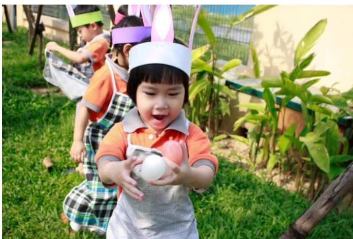
The Easter bunny came to school