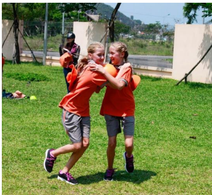
Primary/Secondary Sports Day