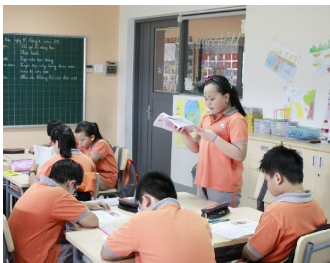
Year 4 students are confident communicators