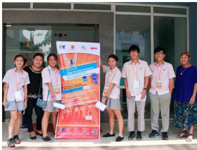
Our MOSWC Students