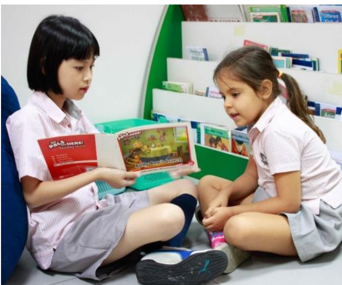
Our students love reading to younger children

The staff of SIS @ Danang are committed to continuous school improvement and our teachers meet regularly to analyse students' progress and discuss and share best practice and future directions we can take that best serve our students. We would also like to hear your opinions on our