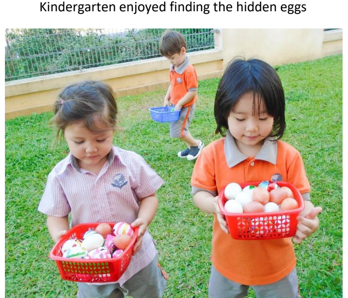
Easter Bunny was very generous!

"We love the Mother Earth" was one of the highlights of the month. We learned about ways of taking care of the environment and the Earth such as cleaning up garbage, protecting animals' habitats, keeping the water clean and recycling.