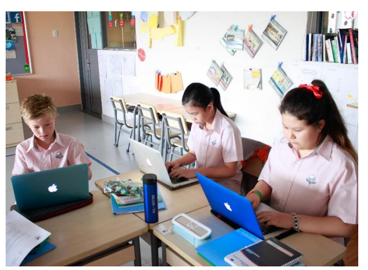
Y6 Int'l diligently doing Typing Practice