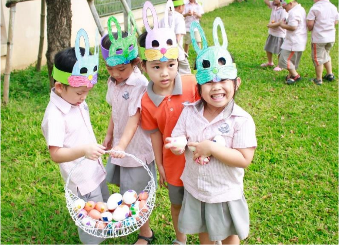
Easter egg hunt!