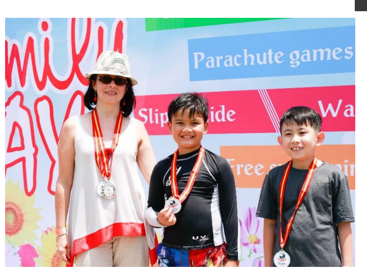
Family Fun Day concluded with the medal ceremony