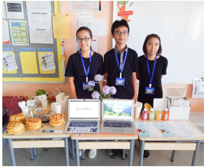
Excellent work shown in IPW presentations

Address: Singapore International School @ Danang SIS Building, Vung Trung 3, Phu My An New Urban Area. Hoa Hai Ward, Ngu Hanh Son District. Da Nang City Tel: +84 236 384 0495 — Fax: +84 236 3981 044 Email: enquiry@danang.sis.edu.vn