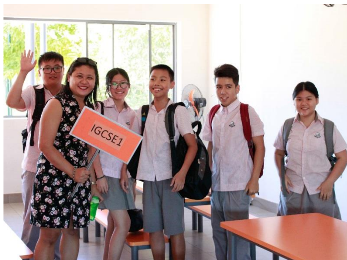
2016 – 2017 cohort of IGCSE 1

Welcome to the 2016-17 school year. It has been very exciting to take up my position as Principal at this school. I have been a Principal for 10 years at a secondary school in Australia and have enjoyed moving to Vietnam to begin in a different school system. I have just completed my Masters of Education in International Schooling at the University of New England and am hoping now to put my learning to practical use.