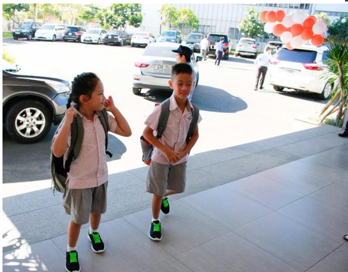
Welcome back to SIS

I have been made to feel very welcome and I know that all other new staff feel the same way. The students have been very polite and it is wonderful to see them all dressed in school uniform. Teachers have been reinforcing the school rules and our first assembly celebrated all the behaviours that students are doing well. We are now particularly working on picking up rubbish after eating and keeping to the right in the corridors and stairs as this ensures the safety of all as the school continues to grow in numbers. I enjoyed meeting parents at the Information morning last Saturday.