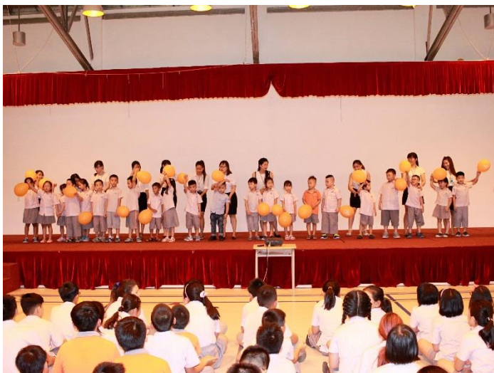
First assembly for 2016 - 2017

In the celebratory atmosphere of the new school year 2016 - 2017, we welcome the students' return to school after their summer holidays, and we are very glad to welcome 23 new students in Year 1 and 35 new students (From Year 2 to Year 9) from the schools in Danang, Hoi An, and Hanoi. We appreciate parents and students who have put their faith in SIS.