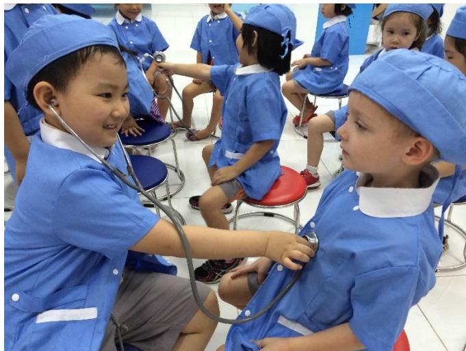
Active and Responsible Citizens learning about Occupations