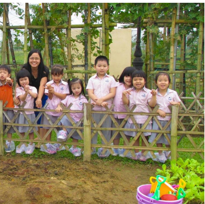
K2 Students love gardening