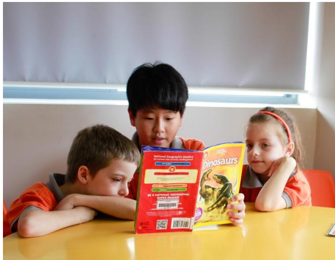
Reading Buddy Time