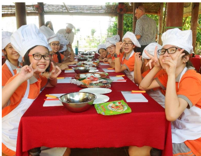
Tra Que Vegetable Garden Excursion