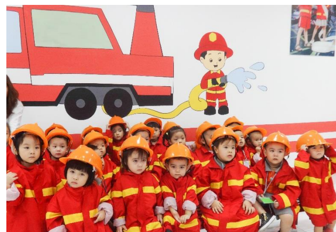
K1 children learning about fire prevention and safety