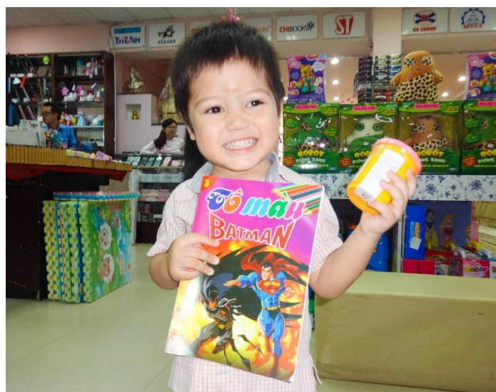
Kindy children enjoyed their Book Week excursions