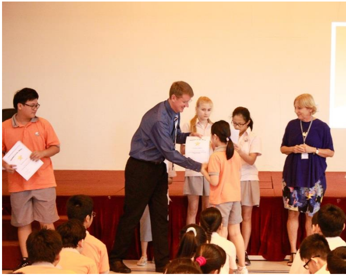
Academic Achievers of the week