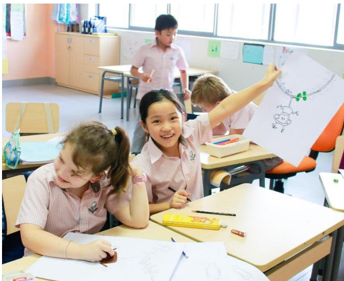
Creative Students enjoying their Art lesson