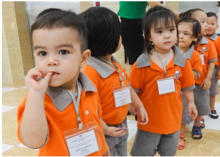
Nursery children enjoy a day out at Vincom Plaza