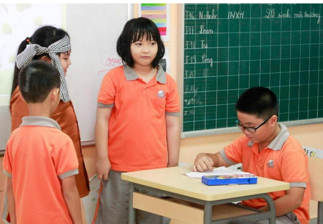
Year 3 Students enjoying a drama lesson