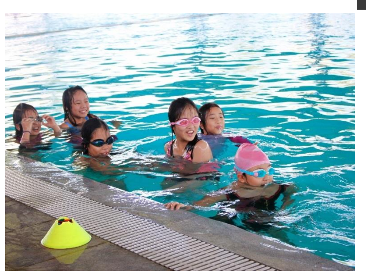
Class 5B girls learning to dive

We want to express our thanks to you for your supportive comments about school operations during the Parent Meeting. We thank you for your suggestions and we will certainly consider all your ideas. The form teachers will inform parents of the response from school.