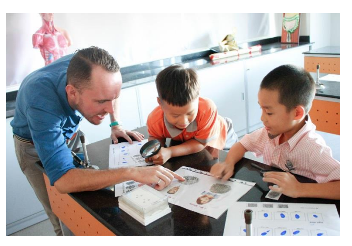
Science Club: Whodunnit?