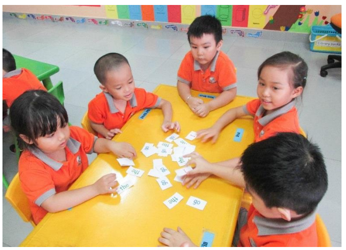
A fun way for Prep students to learn to read!