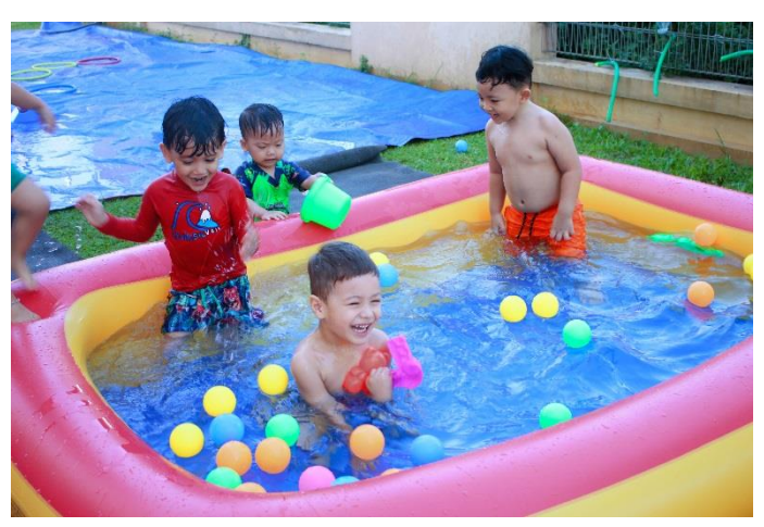
Nursery Water Play Day Water Play is such a great way to learn

Address: Singapore International School @ Danang SIS Building, Vung Trung 3, Phu My An New Urban Area. Hoa Hai Ward, Ngu Hanh Son District. Da Nang City Tel: +84 236 384 0495 — Fax: +84 236 3981 044 Email: enquiry@danang.sis.edu.vn