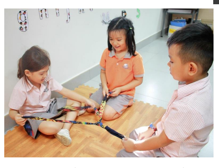
Making a toy for a cat or dog in Animal Welfare after school club