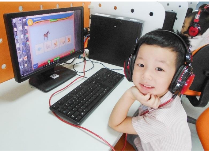
Students love learning in ICT time