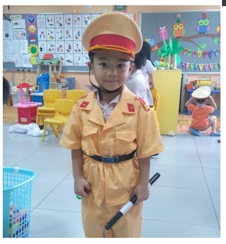
Kindergarten children learn about professions.