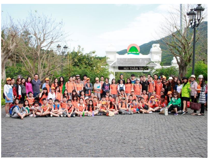
Students and teachers at Than Tai Mountain