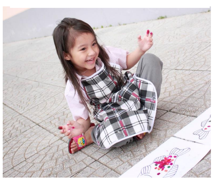
Finger-painting is so much fun!