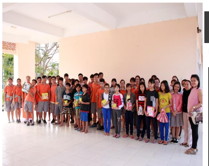
Senior students visited Hoa Mai orphanage to donate food and books and to play games