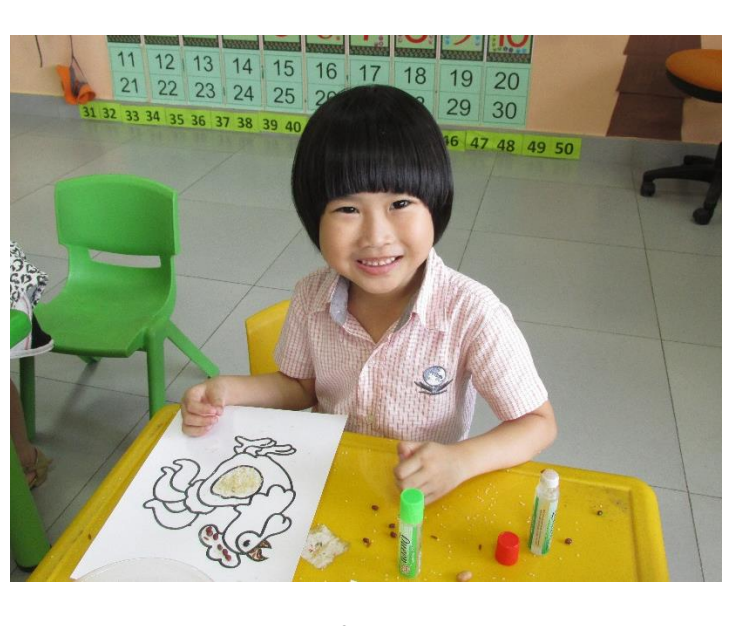
Year of the Rooster