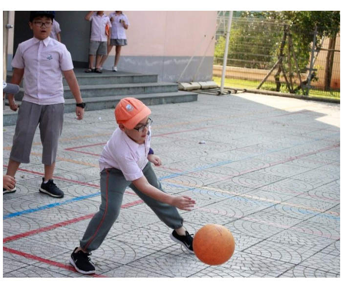
Students enjoy playing handball during breaks