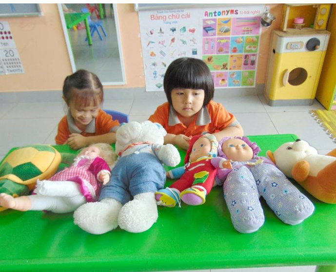
Kindergarten toys model good napping