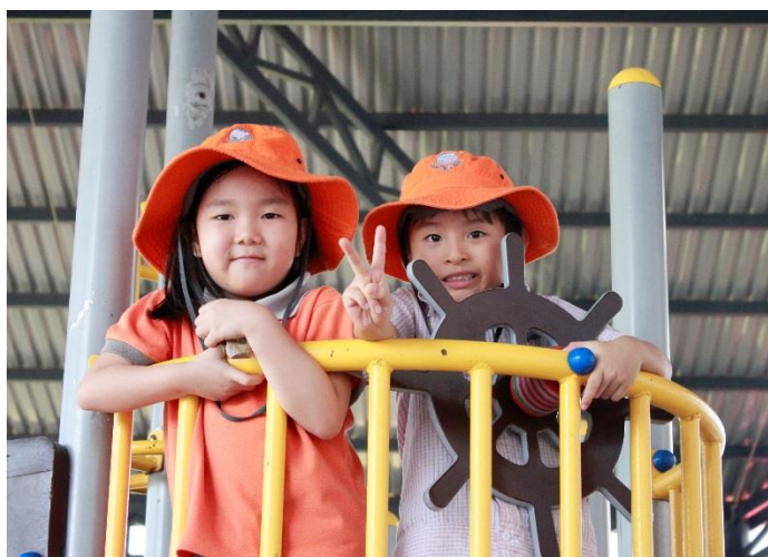
Students love playing on the outdoor equipment