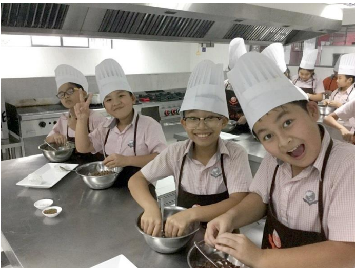
Chefs in the making!

We are now in the final few weeks before the IGCSEs begin. There are two early exams for the ICT practical on 4th April and 6th April. Parents of IG2 please note that 6th April is a public holiday. Students are required to be here for their exam and will not be given a grade for their IGCSE ICT if they do not attend. Good luck to the IG2 students in their final preparation.