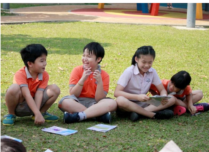
Outdoor activities are an effective way to learn