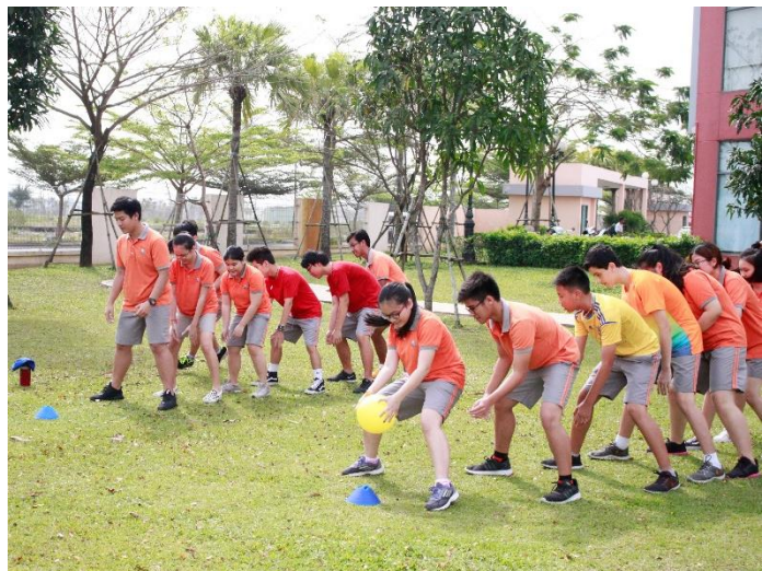
Great teamwork on Sports Day