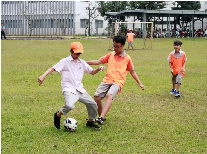
Wonderful participation in the Football Comp

Thirteen Y5 integrated students took part in the Online English Contest at the city level on 4 March. Two Y5 integrated students passed round 15 for the Online Math Contest. These students were selected to take part in the city level contest on 15 March.