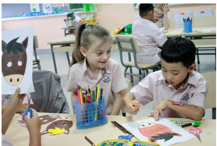
Student love preparing for Assembly