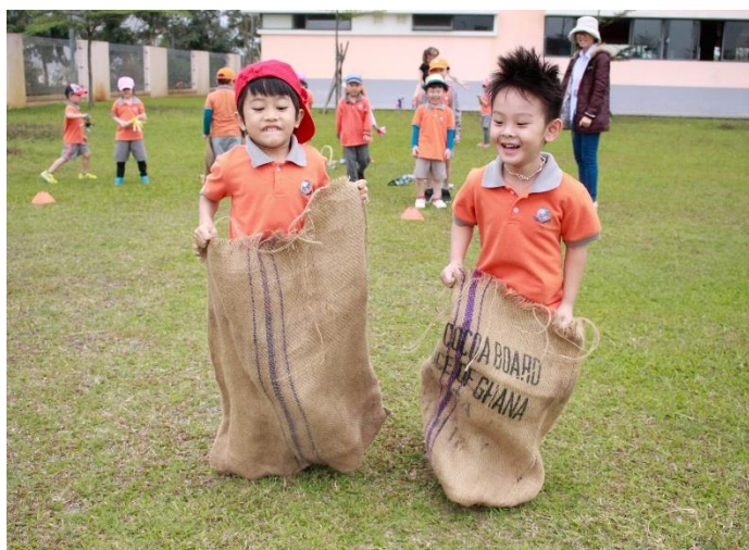
Sports Day was so much fun