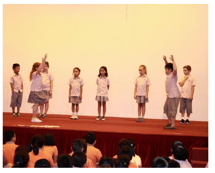
Kung Fu Punctuation?!

Address: Singapore International School @ Danang SIS Building, Vung Trung 3, Phu My An New Urban Area. Hoa Hai Ward, Ngu Hanh Son District. Da Nang City Tel: +84 511 384 0495 – Fax: +84511 3981 044 Email: enquiry@danang.sis.edu.vn