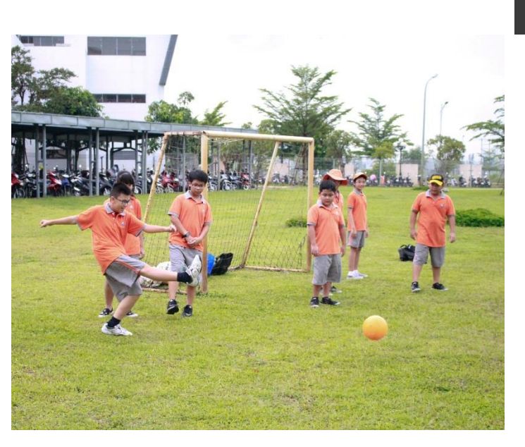
Encouraging an active healthy lifestyle