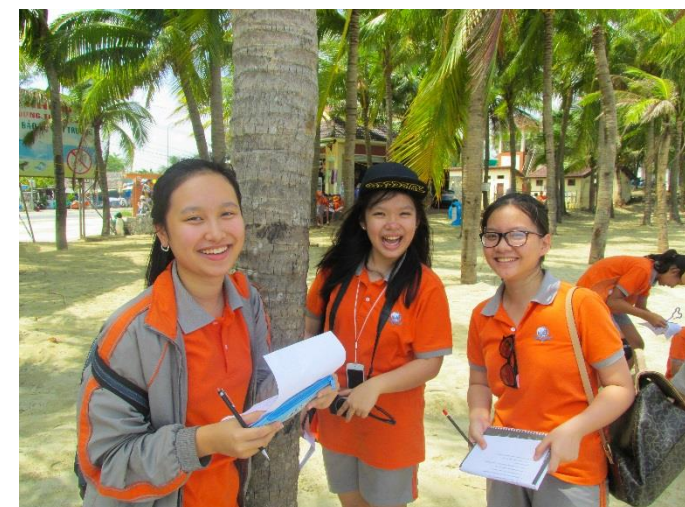
Social Studies excursion at the beach including beach clean up

Another fabulous happening at our school was the participation of some of our classes in the World Education Games. The World Education Games provided our students the opportunity to compete in Mathematics games with students from all over the world in real time. I have seen some of our Year 5/6 International students competing in competitions with other students from Australia, Singapore, Pakistan, America and the United Kingdom. There are many other countries also involved.