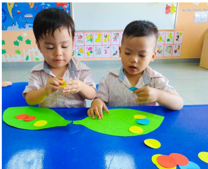
Nursery children learning about colours