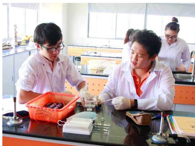
IGCSE 2 Critical Thinkers