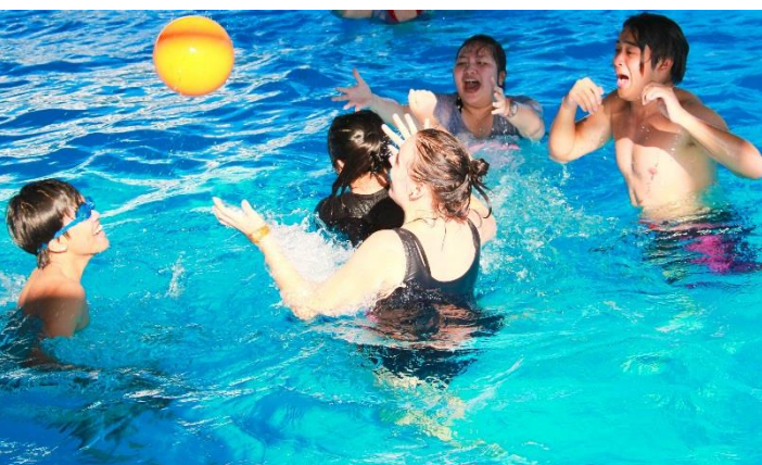
Swim time for the IGCSE 2 students