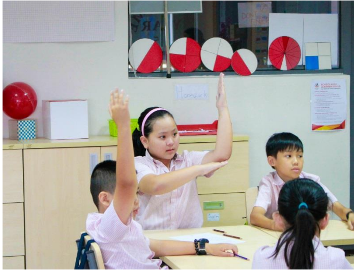
Year 5 – Integrated- Academic Achievers