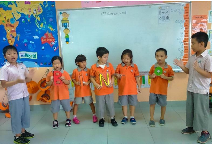
Year3/4 teaching Prep class to be Confident Communicators