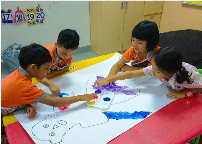
K2A Art Class