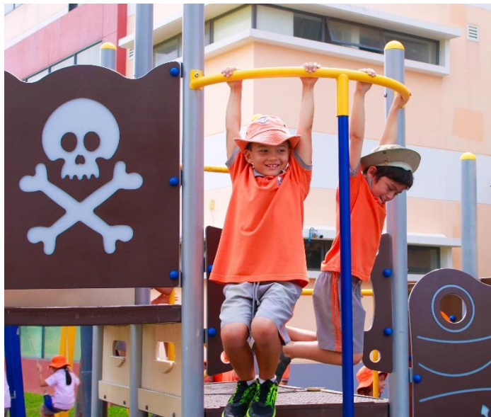
Recess time – Healthy and Active Citizens