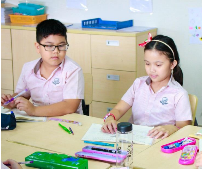
Year 1 – Integrated learning to be Confident Communicators