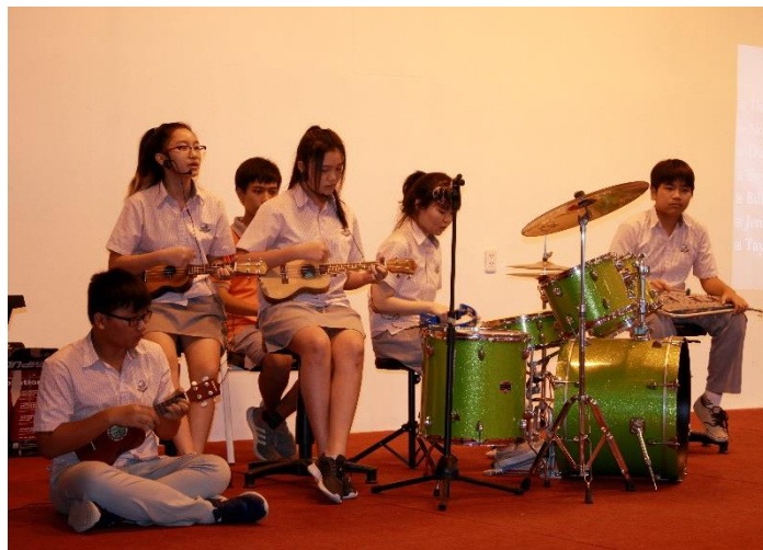
Music Appreciation Day IGCSE 1