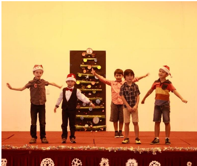
Year 1&2 International students' performance at the charity fair