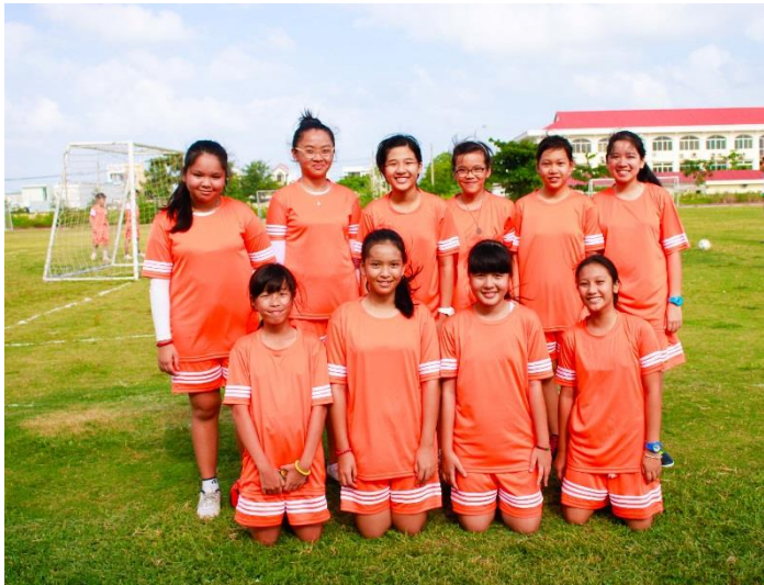
Girls' soccer team