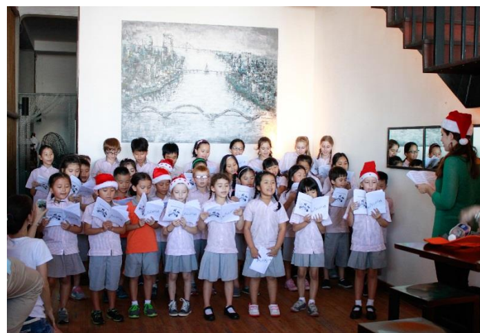
SIS carolers entertaining the community