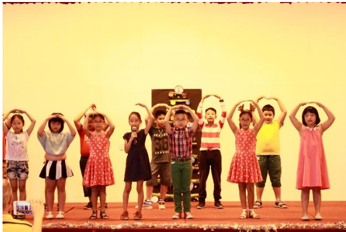
Year 3 Integrated students' performance at the charity fair