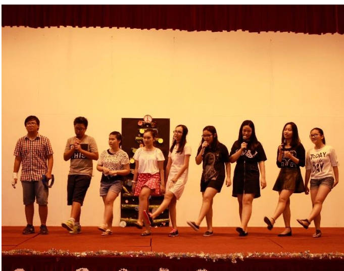
Year 8 and 9 students' performance at the charity fair