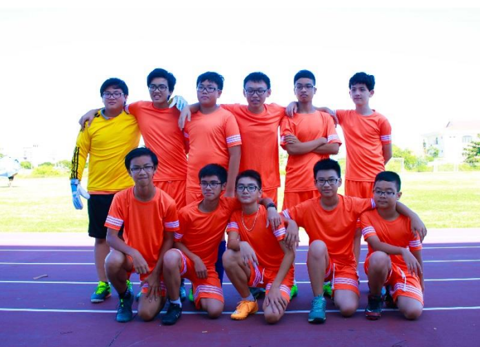
Senior boys' soccer team