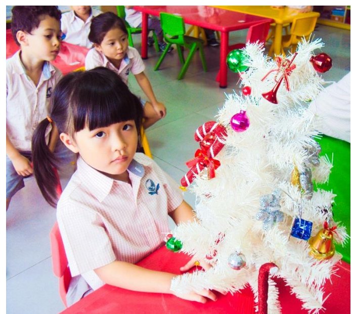
It's looking a lot like Christmas in Prep class