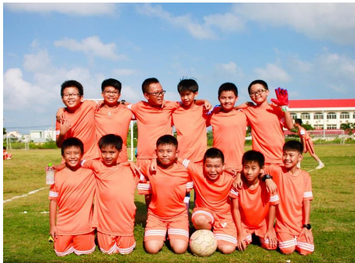
Junior boys' soccer team