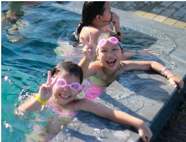
Family Fun Picnic