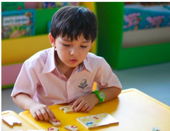
Puzzle time for Kindergarten 2