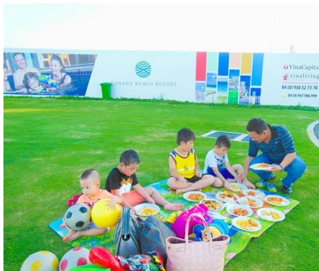
Family Fun Picnic at Ocean Villas