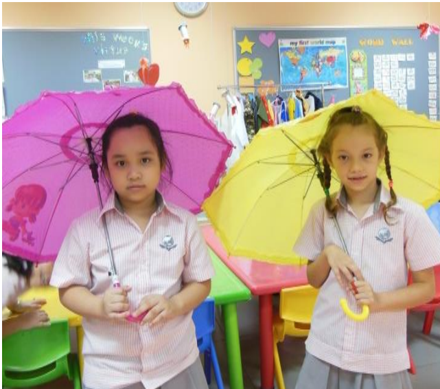
Prep class practising for the End of Year Concert