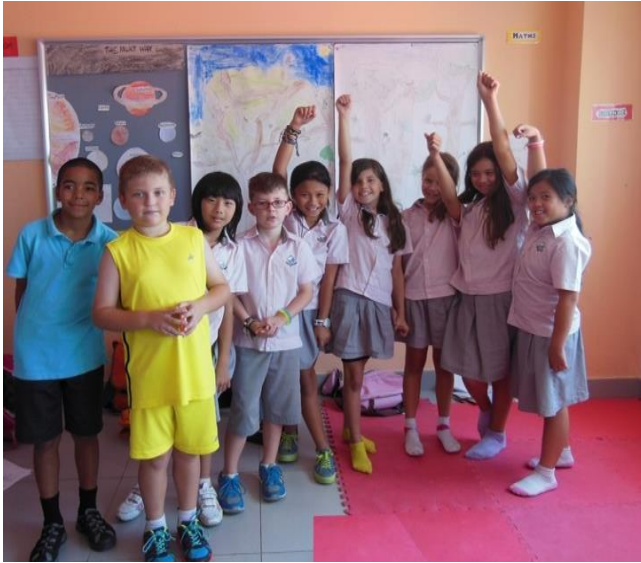
SIS Welcomes Lutz Prep students into their classes