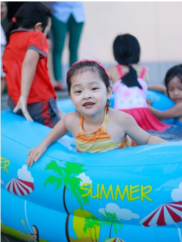
Kindergarten Water Play Time