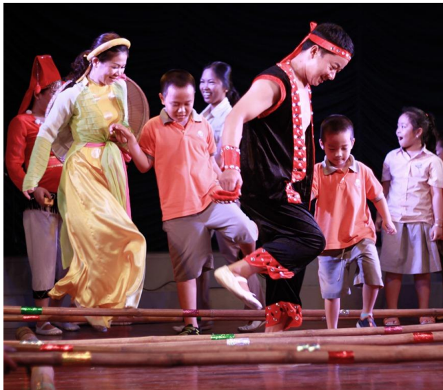
Cultural excursion at Nguyễn Hiền Dĩnh Tuong Theatre